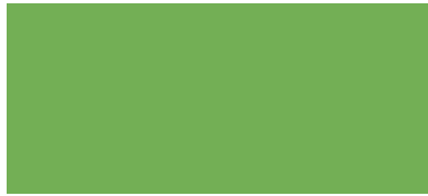
F1004 MISTY GREEN (*7489C)