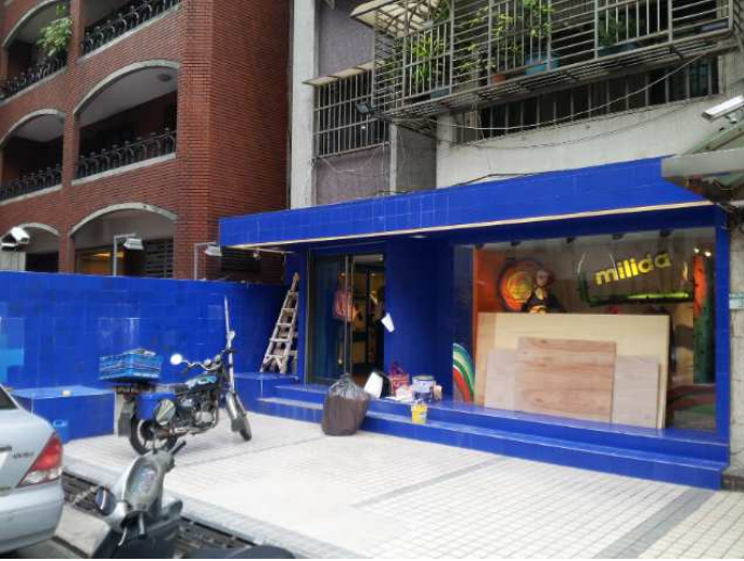
1: Before application