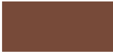
F1013 BROWN (*4705C)