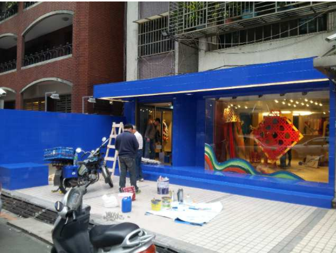
3: FLG 90 (Clear coat)