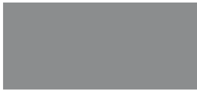
F1005 MISTY GREY (*COOL GRAY 8C)