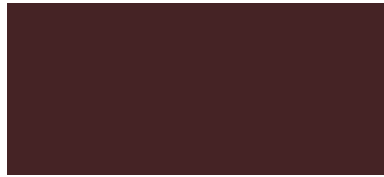
F1012 CHOCOLATE (*4975C)