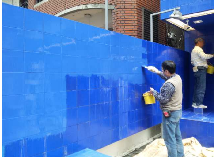
2: FLG 90 mixed with blue pigment