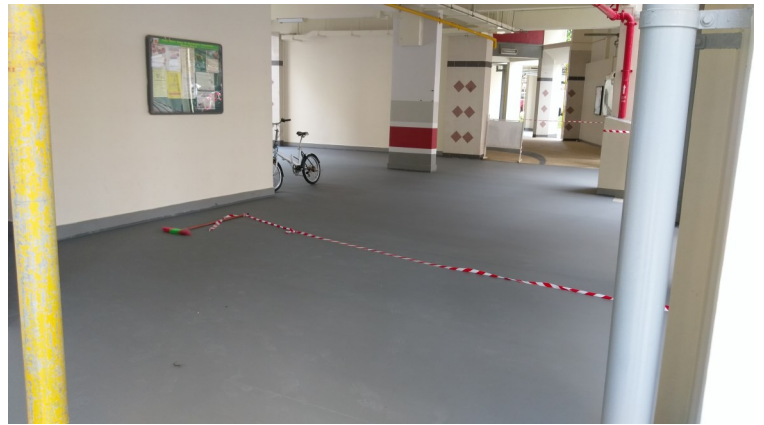
Void Deck Coating