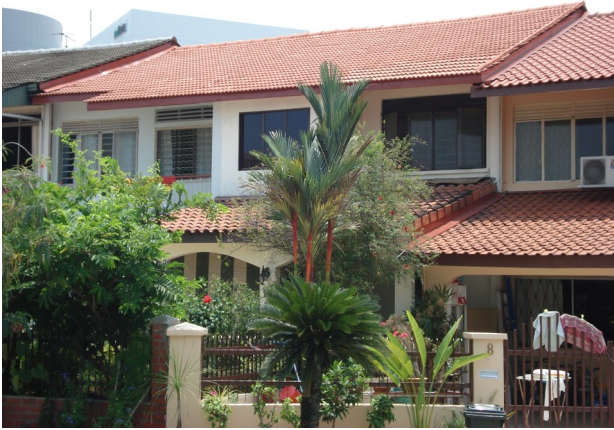
Roof Tile Coating