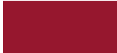
F 1701 BRICK RED F1016 (*181C)