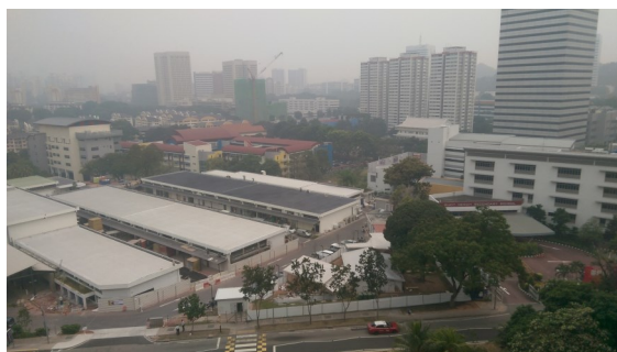
Bukit Merah Metal Roof—Grey Colour