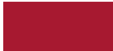
F 1702 CHILLI RED F1017 (*187C)