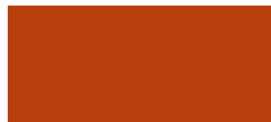
F 1604 GERMAN CLAY F1020 (*7522C)