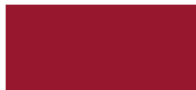
F 1704 COTTAGE RED F1019 (*7427C)