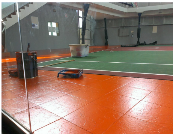
Marine Parade Community Center (June 2013)