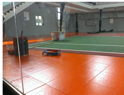
Marine Parade Community Center (June 2013)