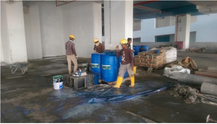
2014-12 Screeding at Gain City Sungei Kadut