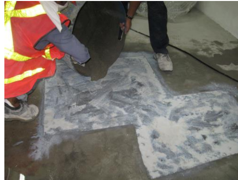
Repair of the car park floor with W1 as bonding Agent Quayside Condo