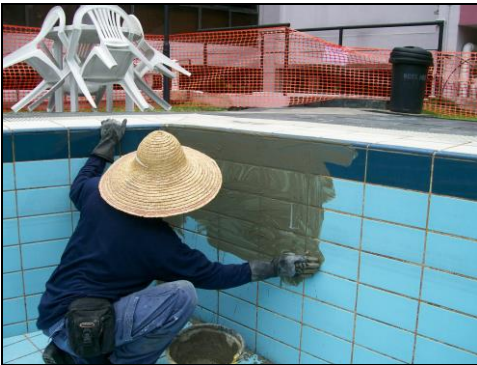
Re-pointing of tile joints in swimming pool, using W1+ cement Jasmine Court