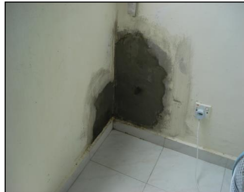
Re-plastering using W1 + cement Geylang Road Lor 38 Office.