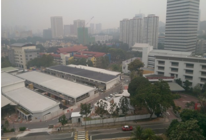
Bukit Merah Metal Roof in