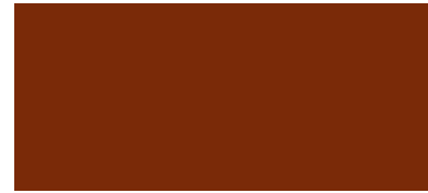
F 1707 CHOCOLATE RAL 8022