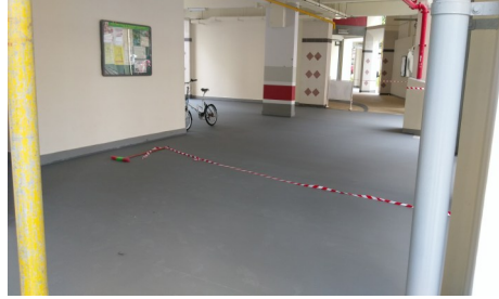
Floor Coating at HDB void