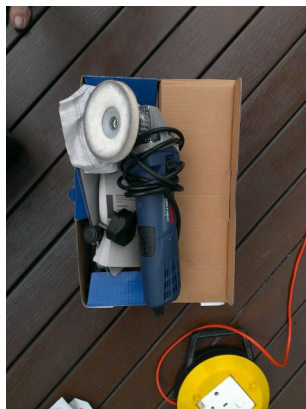
Polishing wax used for polishing stainless steel