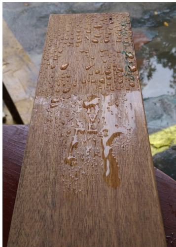
SS10 on wood surface