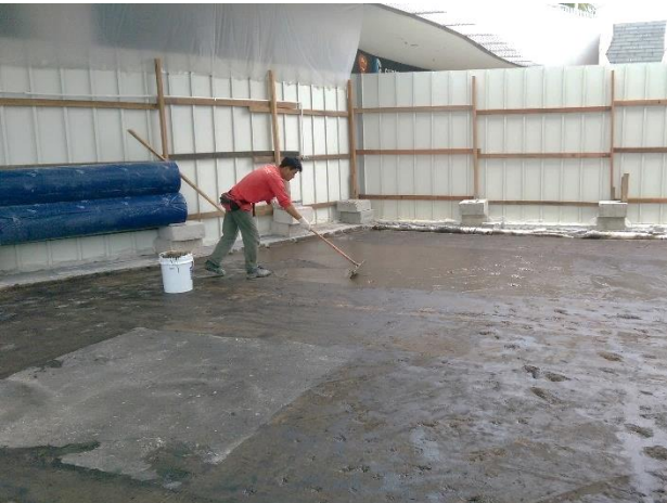
W4 Water Repellent, W7 Christy Seal and DPC Damp Proof Coating flooded over to crystalize and stop leak. Area: 16,000 sq. ft