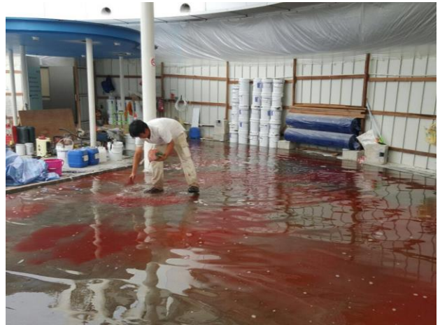
Flooding test for 72 hours