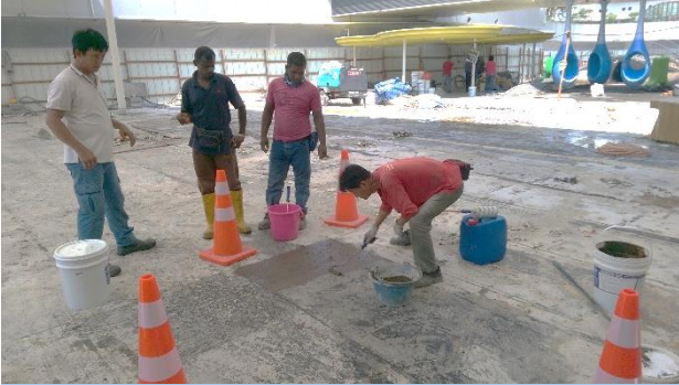
Workers being briefed on application of W4 Water Repellent and DPC Damp Proof Coating .

VIVOCITY OPEN DECK PLAYGROUND CONTRACTOR: SHINHWA CONSTRUCTION PTE LTD