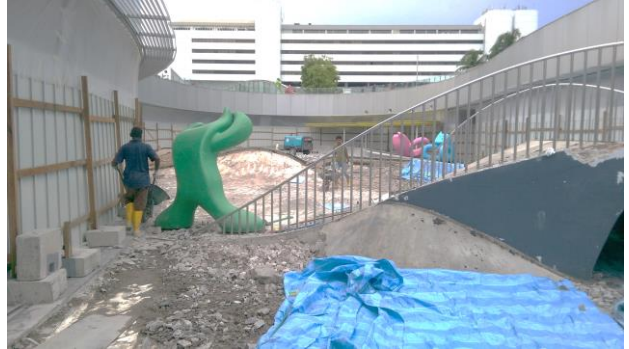
Demolition of previous structures.