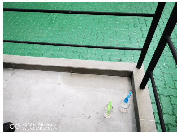
After treatment, free calcium may flow out from the cement joint. It can be removed by scrubbing. Suggest pre-treating the joint with SS10 before AS17 treatment.