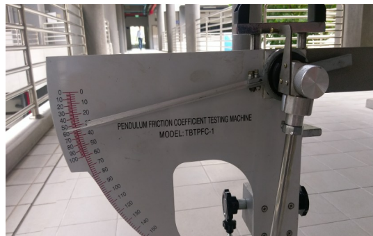
Anti-slip test reading above 40—possibility of slip is extremely low.