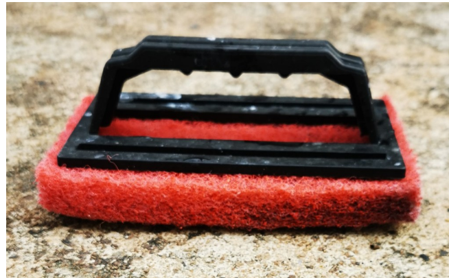
Scrub the floor with AS17. Wear goggles and gloves to protect yourself.