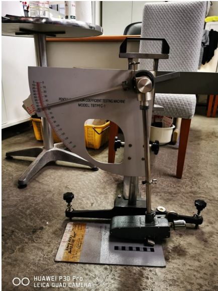
Safe high reading of 88. Reading above 40 is safe.