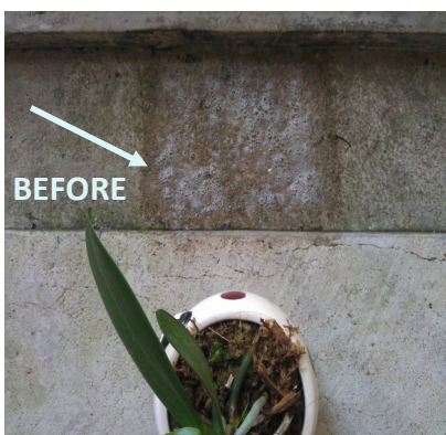
C100 Citric Kleen Applied Overnight