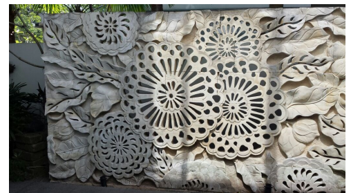
Whitens after treatment