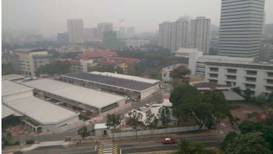
Bukit Merah Metal Roof in Grey Colour