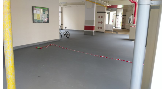
Floor Coating at HDB void deck