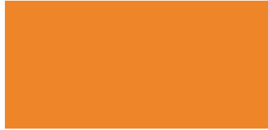
F 1602 FRENCH CLAY RAL 2004