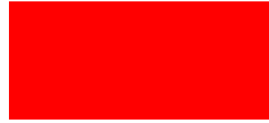
F 1702 CHILLI RED RAL 2005